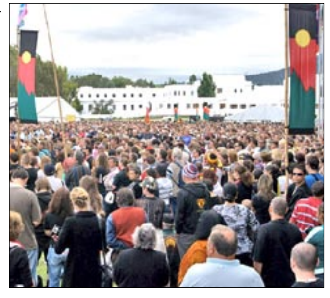
A new way. Part of the huge crowd in Canberra for the formal apology to the stolen generation.

The people inside like the media "sign in" on the desk in the car park, the liaison people, the ushers, the tea makers all saying again and