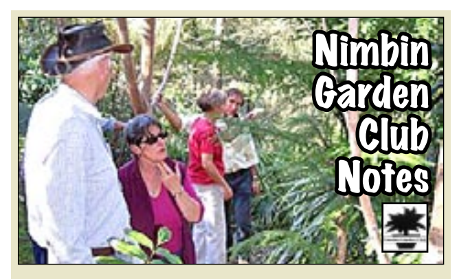
Sharing. Garden Club members at various recent monthly meetings (above and below).