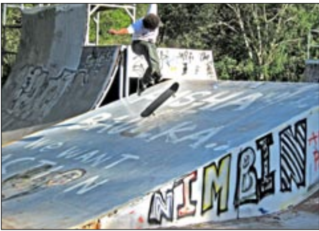
Temptation. A Cornish backpacker on the ramp (above); Cedric shows some bike moves (below); Ezra (bottom left).

It appears that the new Council is very interested in achieving an outcome for the skatepark and is ready to engage with community