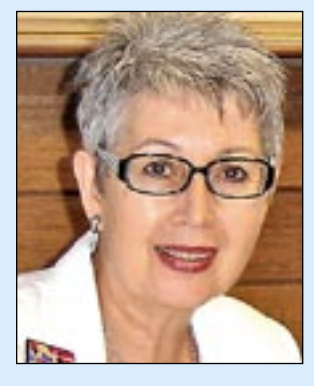
by Jenny Dowell Mayor of Lismore