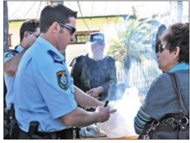
Police being grilled at the BBQ, and (right) an early protester atop the Nimbin tower.

Surely you understand why we couldn't warn the community about the Tower.