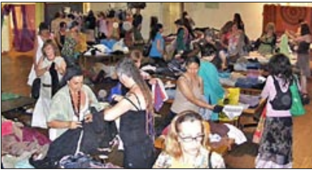
Nimbin's Biggest Ever Clothes Swap in November.

We would like to take this opportunity to publicly thank all of those businesses and organisations who have helped us this year. Their generous gifts of time, goods and