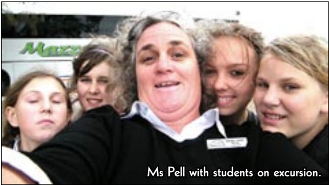
Ms Pell with students on excursion.

When a school achieves excellent growth, it is an indicator that all is well; the students are engaged and are learning well, the programs the teachers are providing are attuned to the needs of the students and are captivating