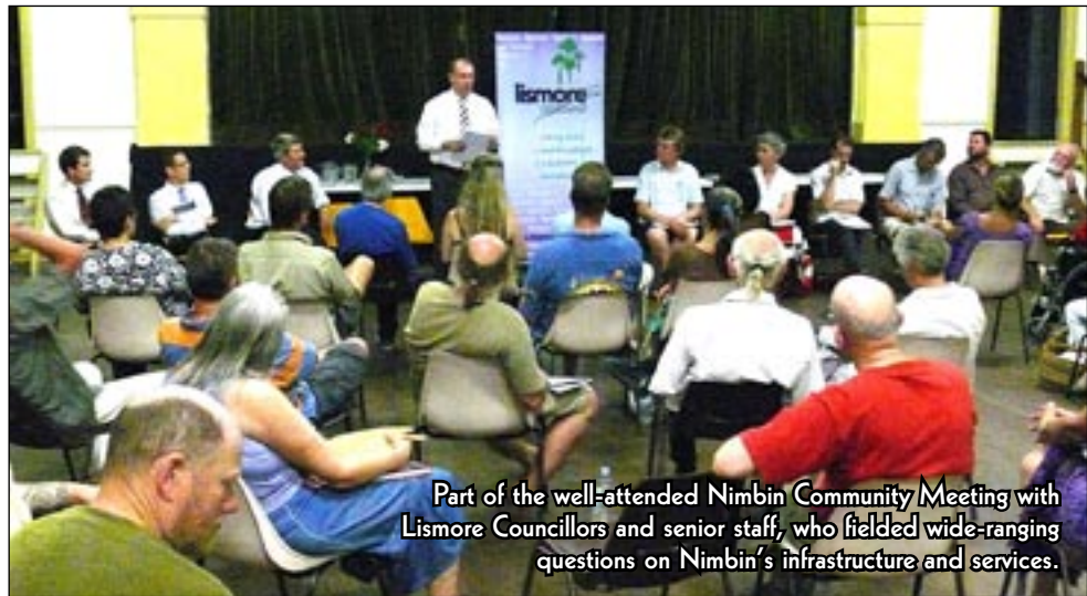
Part of the well-attended Nimbin Community Meeting with Lismore Councillors and senior staff, who fielded wide-ranging questions on Nimbin's infrastructure and services.