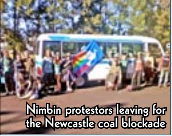
Nimbin protesters leaving for the Newcastle coal blockade

Transgrid was thumbs-down by certain Council members who found it more appropriate to install solar power on all the homes in the