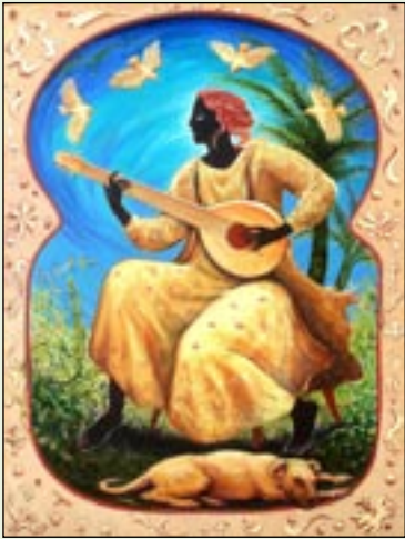
Singing to the Birds

The theme of this exhibition evolved out of a desire to produce a series of images that affirm strength and positive energy.