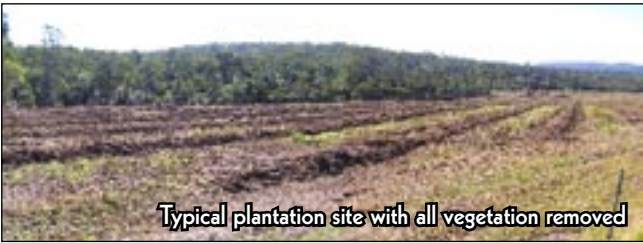
Typical plantation site with all vegetation removed

Mr Morrison also criticised the cultural impacts of plantations on local communities.