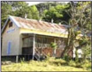
Round Three of the "Country Halls Renewal Fund" is now open and looking for applications.

It is very hard to get any funds for capital infrastructure, and renewing an old roof isn't a very exciting sounding project, so we are truly grateful to NSW Rural Affairs.