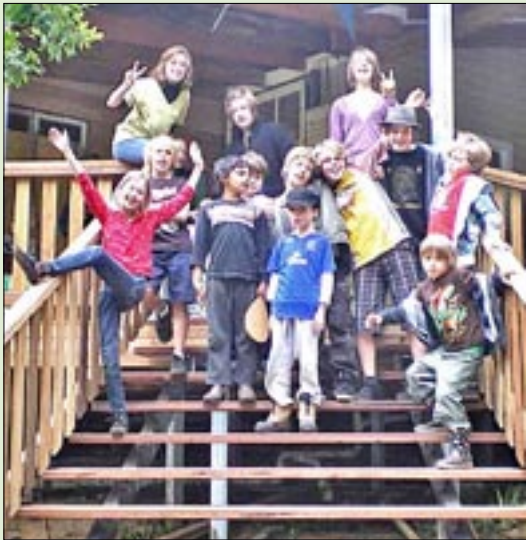
Some students testing the new entrance to the school.

Tuntable Falls Community Primary School turns 30 in March, and the community invites present and past members of the school community, as well as the wider community, to join them for a celebration. The celebration takes place on the weekend of the 19 and 20 March at Tuntable Falls Community. A story-sharing day for past school members will be held on the Saturday, where a light lunch and afternoon tea will be provided. Visitors will be able to view and access some of the archival material that chronicles the growth and history of the school, and photographs will be available for purchase.