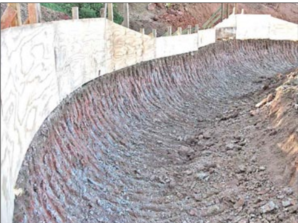
Big Snake trail under construction at the Nimbin Skate Park. Work is now scheduled to be finished by the end of February, weather permitting.