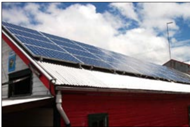
40-panel solar array on the roof of the Nimbin Community School's property in Cullen Street

Our purpose built grain mill has been ordered from the manufacturers in Germany. The grain mill will help protect the local community from spikes in