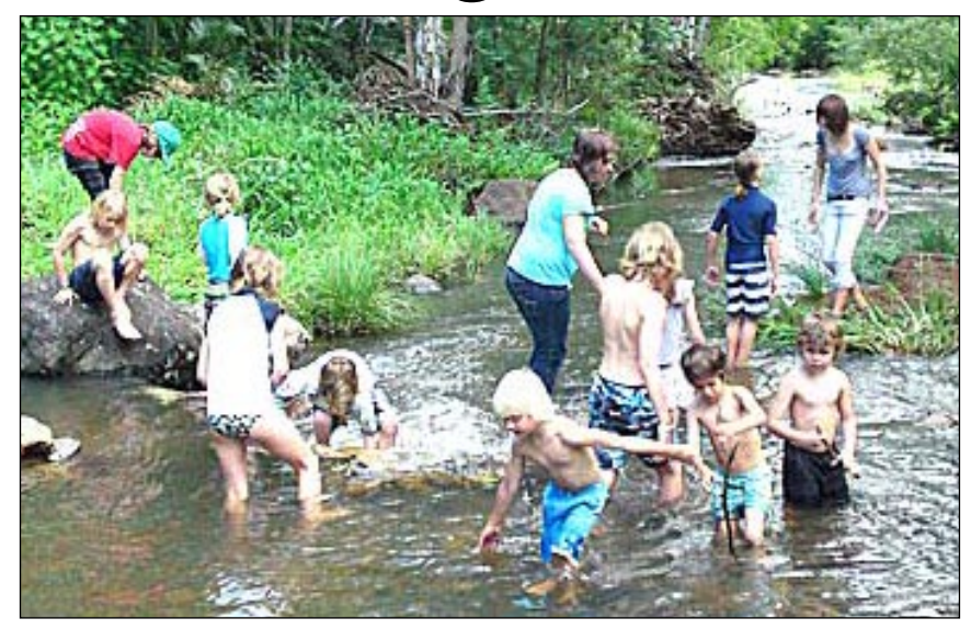
Cooling off at our beautiful creek after a long hot day

values persist: Offering an alternative education that nurtures children within a strong sense of community, the relationship between family and school being integral.