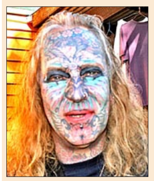
Professionally done: A competitor in the Pot Art Tattoo competition during MardiGrass.

She said there is a legal and moral obligation on registered tattooists to make sure their clients are over-18 and sober. They must have completed a Health Department course, and operate in a sterile environment.