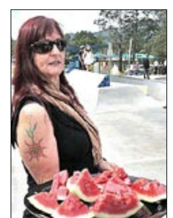
Break-n-Enter spots are filling fast and booking is encouraged. For more information visit the website www.sba.org.au

Prize packs will be awarded during the workshops.