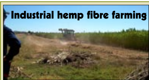
Farmer at Ashford windrowing the hemp in the first season of roundbaling. ABC's Landline program filmed it for an episode on industrial hemp to screen in May.

There's been quite a bit of progress in the NSW fibre industry with a steady stream of enquiries coming to the Northern Rivers Hemp Association from people interested in farming hemp.