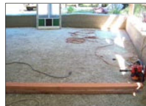
The first layer of the floor has been put down in 50mm layers then tamped. Then we did the first layer of the walls.

Please continue to support the raffle. So far we have raised over $240 towards the roofing materials. We need around $750 in total to complete the roof. The first six prizes will be drawn at the Oasis Café on Wednesday 25th January, next year.