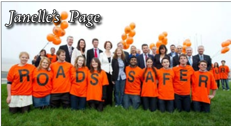
TWU and Labor MPs and Senators celebrating passing of the legislation for Safe Rates