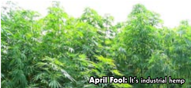
April Fool: It's industrial hemp