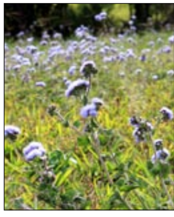
Ageratum will reduce the carrying capacity of pasture

A vigorous immigrant, it can form large dense patches excluding other herbaceous plants. Often found colonising disturbed areas it can also make itself at home in undisturbed bushland. In Queensland it has been discovered growing in