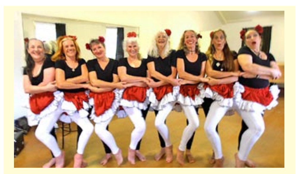
These are No Mad Bitches backstage before performing at the Women's Dinner. We also performed at the Blue Moon. Both performances were filmed, and the Blue Moon one is already on YouTube gathering hits. <a href="http://youtu.be/syxabSs9C6Q">http://youtu.be/syxabSs9C6Q</a> We're going to try to get the Women's Dinner clip up there too, because we did a better performance there. No Mad Bitches came out of a merger between the Nomads and the Tap Bitches ... and in this act we are literally fused together, because we're sharing tights, and all in one big skirt!