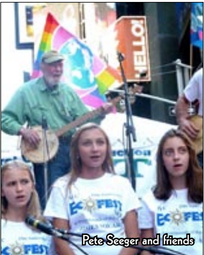
Pete Seeger and friends