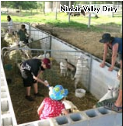
Nimbin Valley Dairy