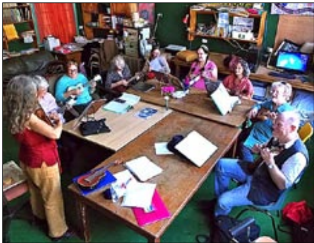
Ukelele class in Term 3