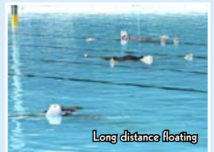
Long distance floating

ceremony. The day was gallantly MCed, loud-hailer in hand, by the ever-cheerful Andrew from the Tourist Information Centre.