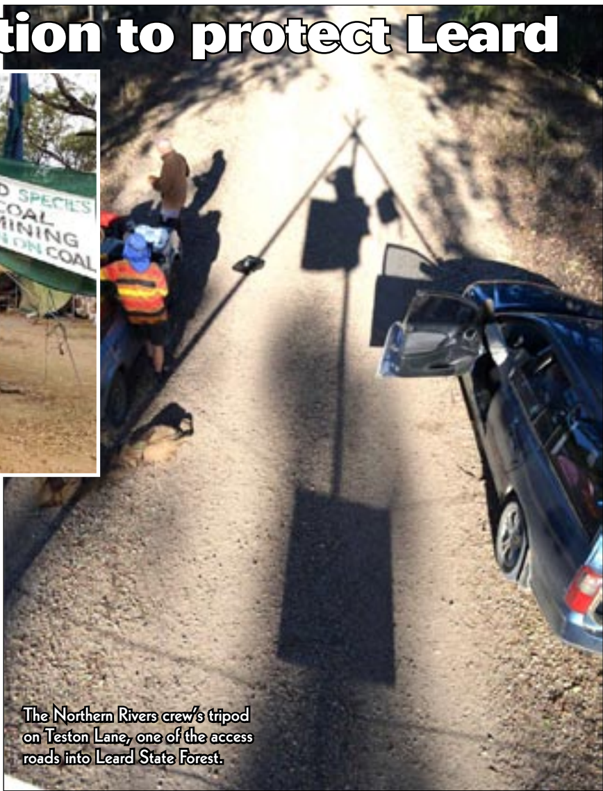
The Northern Rivers crew's tripod on Teston Lane, one of the access roads into Leard State Forest.

Next day Whitehaven Coal continued to refuse, as they had been for a month, to hand over the independent ecologist's report on the claimed offsets for the critically endangered White Box community. The original offsets had been fraudulently claimed to be as good or better than the White Box Gum ecological community proposed to be destroyed by Cumberland Ecology who are now being investigated by the Ecological Society.