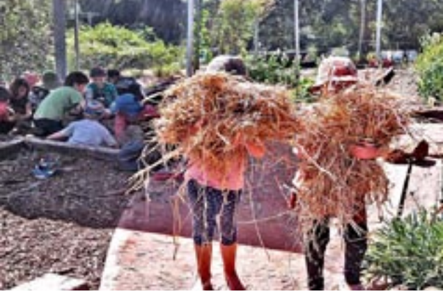
Unique Place, Unique Education