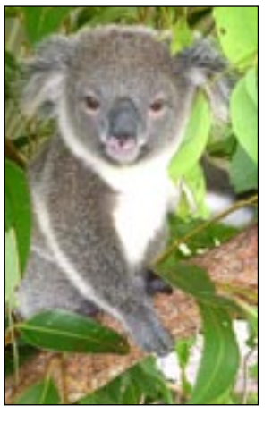
Tuppence, the joey

In my last column I mentioned that many of the koalas I spotted during the Great Koala Count were displaying visible signs of disease. Over the last quarter of 2013 of the 110 koalas admitted into care by Friends of the Koala 81 resulted in mortalities, due overwhelmingly to disease.