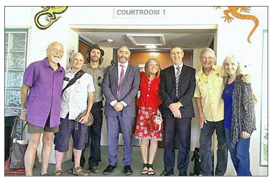
Outside Lismore court house on 9th December

"Even so, protestors are delighted to have the matters resolved," said president of the Northern Rivers