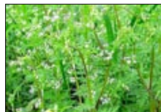
Anthriscus cerefolium : Chervil Myrrhis odorata : Sweet Cicely

Chervil, Syn. French Parsley, Cerfeuil, Var: Brussel's winter, 'Cerfeuil Frise', Vertissimo. Sweet Cicely, Syn. Chartreuse.