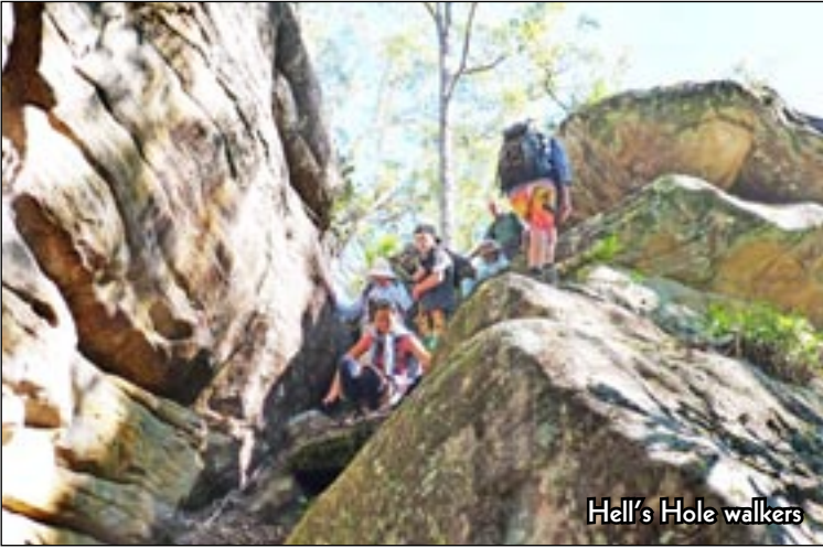
Hell's Hole walkers