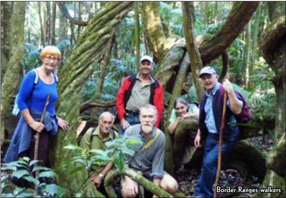
Border Ranges walkers