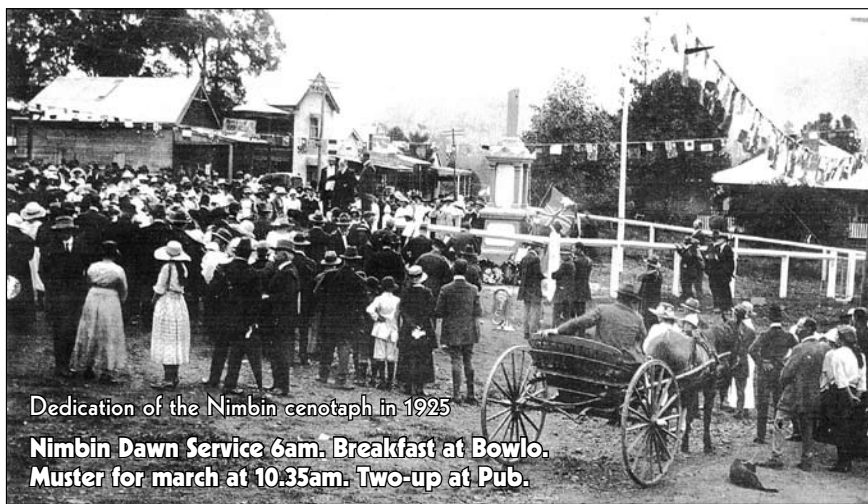
Dedication of the Nimbin cenotaph in 1925

All over Australia, in towns and cities, there are official memorials to honour the fallen. Although the memorials are typically to those who served in WWI and WWII and tend to be thought of just as places of remembrance, they have a much broader place in the community.