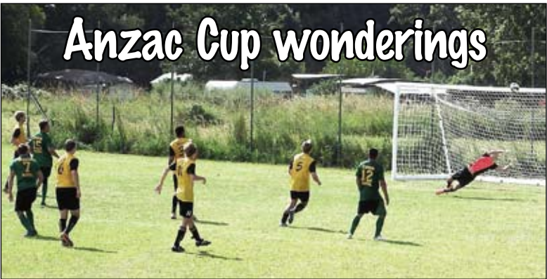
Goonellabah keeper makes one of many saves at the Headers field in the nil-all draw