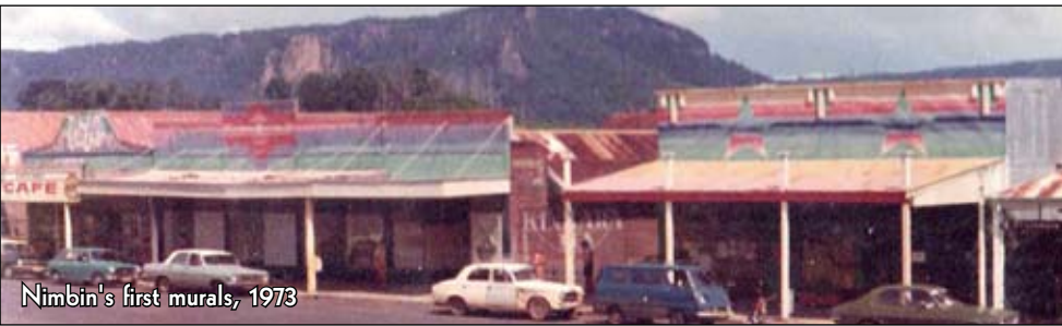
Nimbin's first murals, 1973