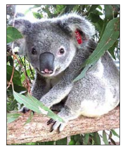
'Razor Bob' on the wire and in care

We never cease to be amazed at some of the crazy places koalas end up but we reckon 'Razor Bob' took the cake last month. A young male, he somehow got inside the razor wire at the Dunoon Essential Energy sub-station, pacing back and forth in the wire for at least two hours before his rescue could be affected. With two Essential Energy workers on one side of the fence and Friends of the Koala's trusty rescuer on the other (well away from potential electrocution)