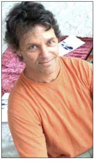
by David Ward Life action coach

A secondary element of dependence arises from the physiological effects of the substance or behaviour. As the body and mind grow used to the comfort of the escape provided, there is an adjustment required