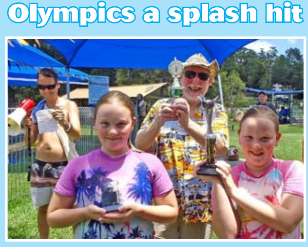
• See story page 3.