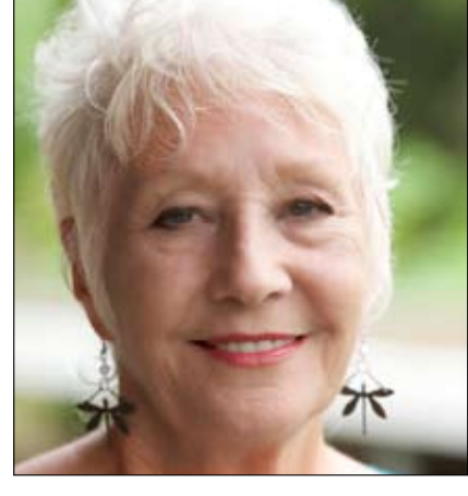
by Tonia Haynes

of protection against disease due to its ability to communicate with the immune and other systems, which assist us to live. Therefore, any dysfunction or injury of muscles, bones or tissue that interferes with the associated connective tissue can also cause other parts of our body to work less efficiently.