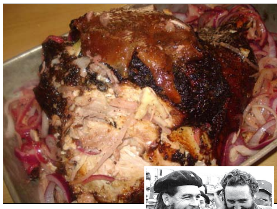
The Imbibers Ark by Thom Culpeper