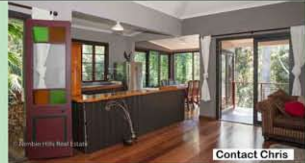
1157 Stony Chute Road, Nimbin