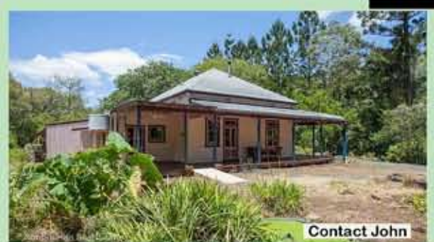
336 Stony Chute Road, Stony Chute $650,000