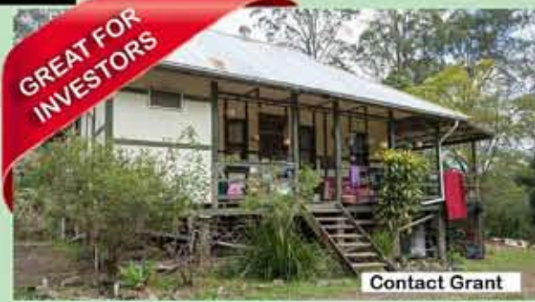
85 Lillian Rock Road, Nimbin