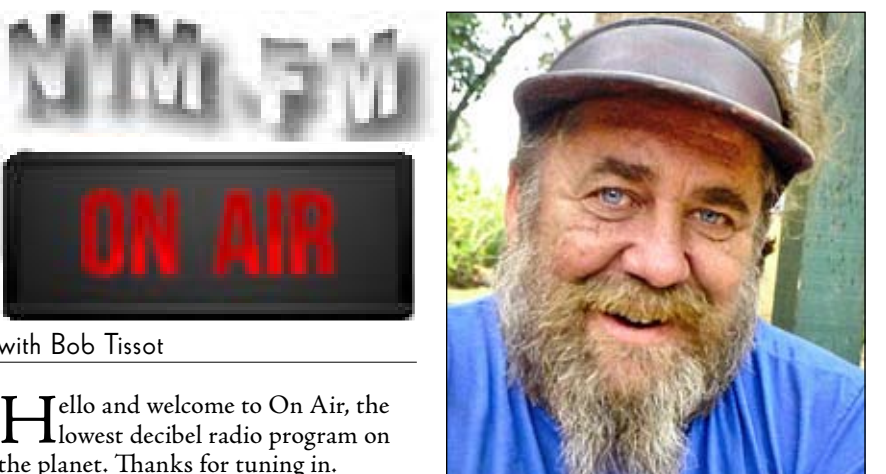
Get the F#*% Up

PS. Every year since my initial anti-Santa rant a few years ago, I get asked to rip the shit out of Xmas in my December column. Since Xmas is supposedly meant to celebrate a woman giving birth, may I indulge those requests by simply stating that I reckon it's a cunt of a time.