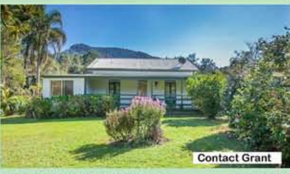
289 Crofton Road, Nimbin