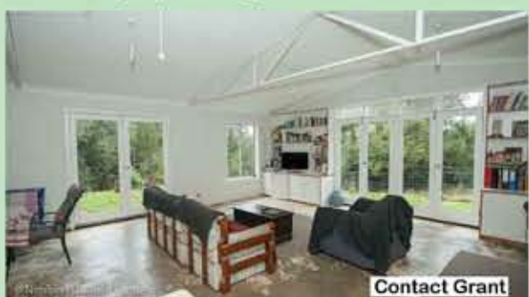
144 Bertoli Road, Jiggi