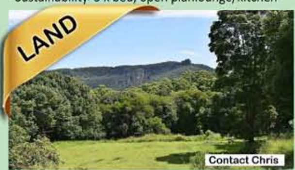
13a High Street, Nimbin