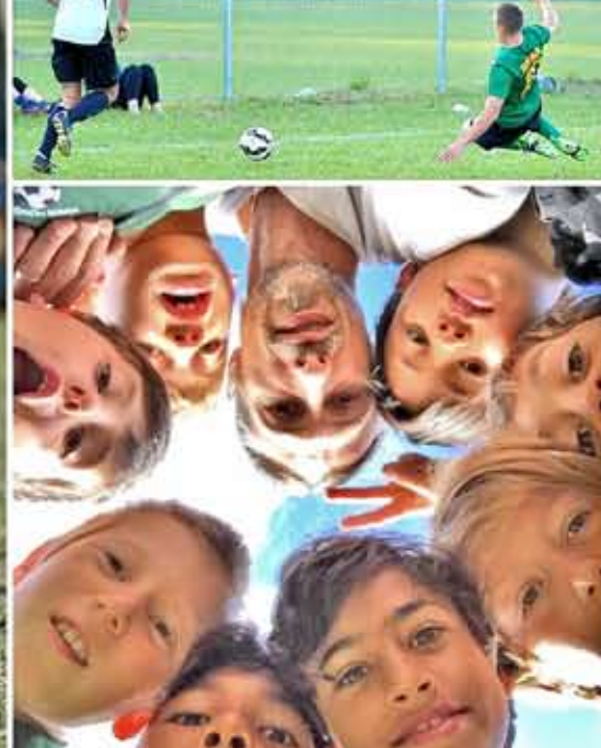
Page 38 The Nimbin GoodTimes