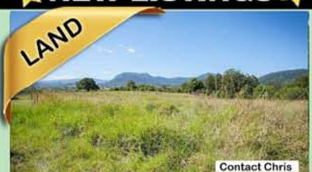
34/78 Cecil Street, Nimbin