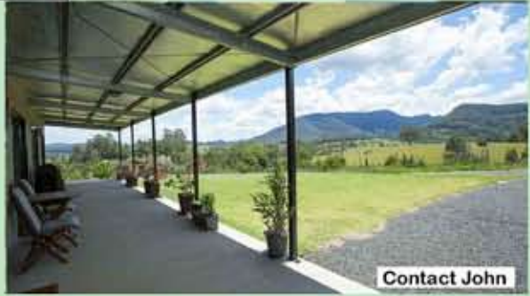
61 Tulsi Lane, Nimbin

Has the 'WOW factor'. Picturesque, fenced cattle paddocks Big clean dams, fruit trees, rainforest pocket and views galore! 2 x bed timber home, fire, raked ceilings, polished wood floors