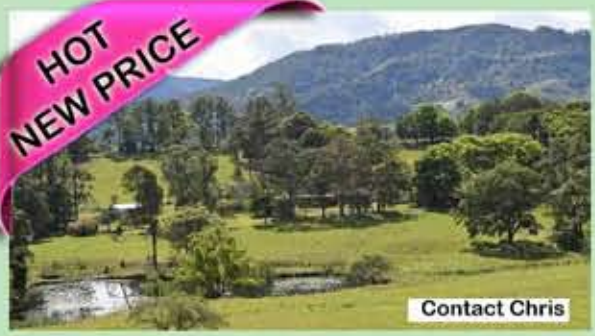
25 Kirkland Road, Nimbin