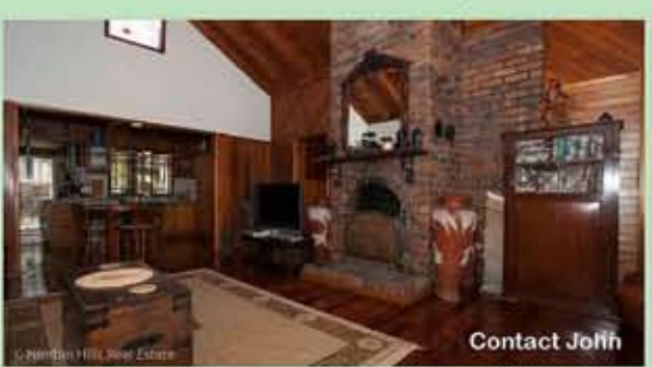
5401 Kyogle Road, Cawongla