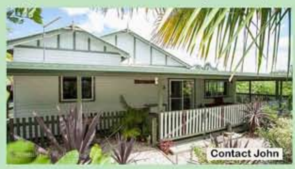
315 Sargents Road, Homeleigh