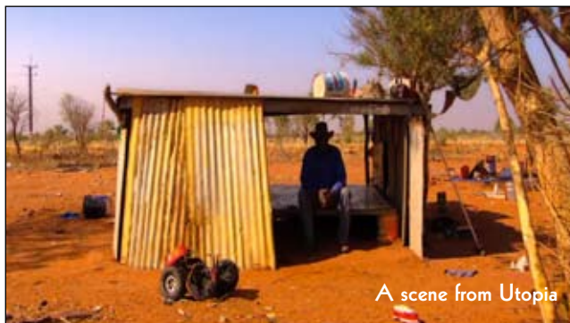
A scene from Utopia

First up, on Friday 12th February, its screen will play host to a star-studded comical romp through a fictional Central European country called Zubrowka, with the 2014 British-German-US production of Wes Anderson's The Grand Budapest Café [rated 'M']. Anderson is known for his focus on style and aesthetics, and this classy and fantastical