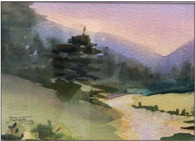
'Towards the mountain'

Committee members have started gearing up for this year's Autumn Arts Extravaganza, our annual exhibition in the Nimbin Town Hall, starting 24th March and running for three weeks.