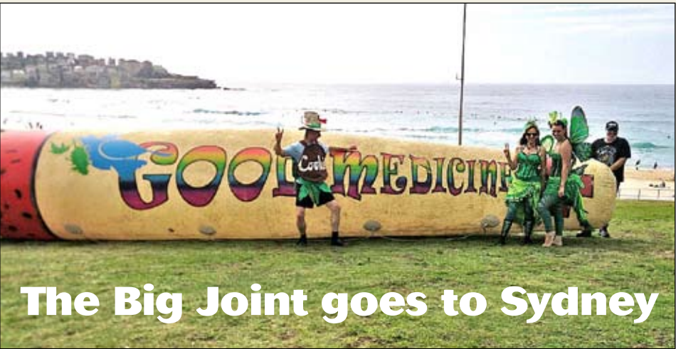
The Big Joint goes to Sydney