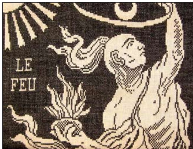
'Feu' (detail) by Eric Smith

The start of a new adventure at Blue Knob Hall Gallery with the opening of our ceramic studio is being honoured by the artists and members who exhibit