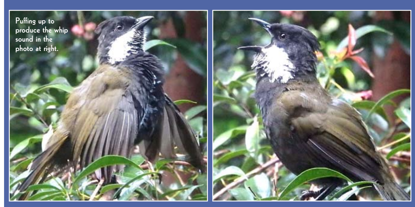
The eastern whipbird (Psophodes olivaceus) is an insectivorous passerine bird native to the east coast of Australia, its whip-crack call a familiar sound in forests of eastern Australia. Two subspecies are recognised. Heard much more often than seen, it is a dark olive-green and black in colour with a distinctive white cheek patch and crest. The male and female are similar in plumage.