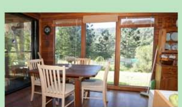
16/265 Martin Road, Larnook$215,000- Just under 3 acres of strata title. Lovely 360 deg views- Abundance of water from creek, dam & waterfall- Cosy cabin/dwelling with stand-alone solar. Tranquil