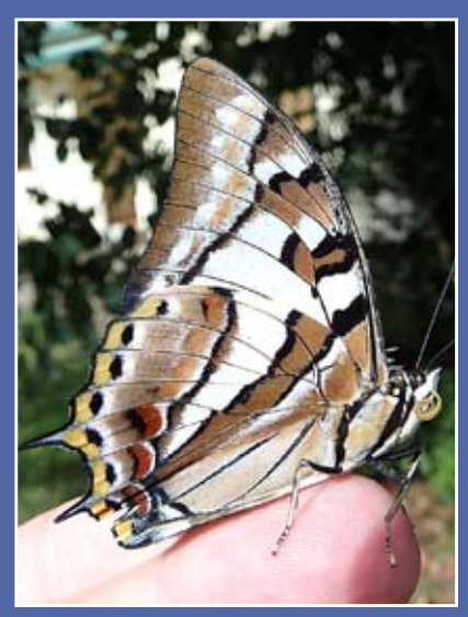
Tailed Emperor butterfly, Polyura pyrrhus Family Nymphalidae, Subfamily Charaxinae I discovered this butterfly beside the road in Thorburn Street during May.