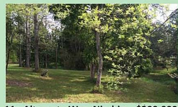
11a Alternate Way, Nimbin $299,000