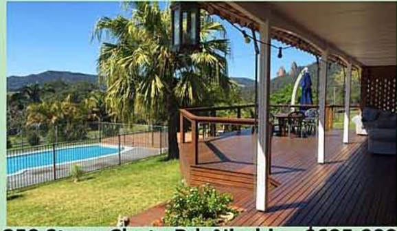
259 Stony Chute Rd, Nimbin $695,000