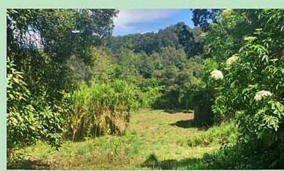
21/265 Martin Rd, Larnook $105,000 PRICE REDUCTION!