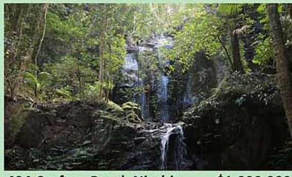
494 Crofton Road, Nimbin