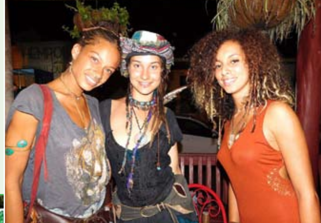
May 2016 The Nimbin GoodTimes Page 19