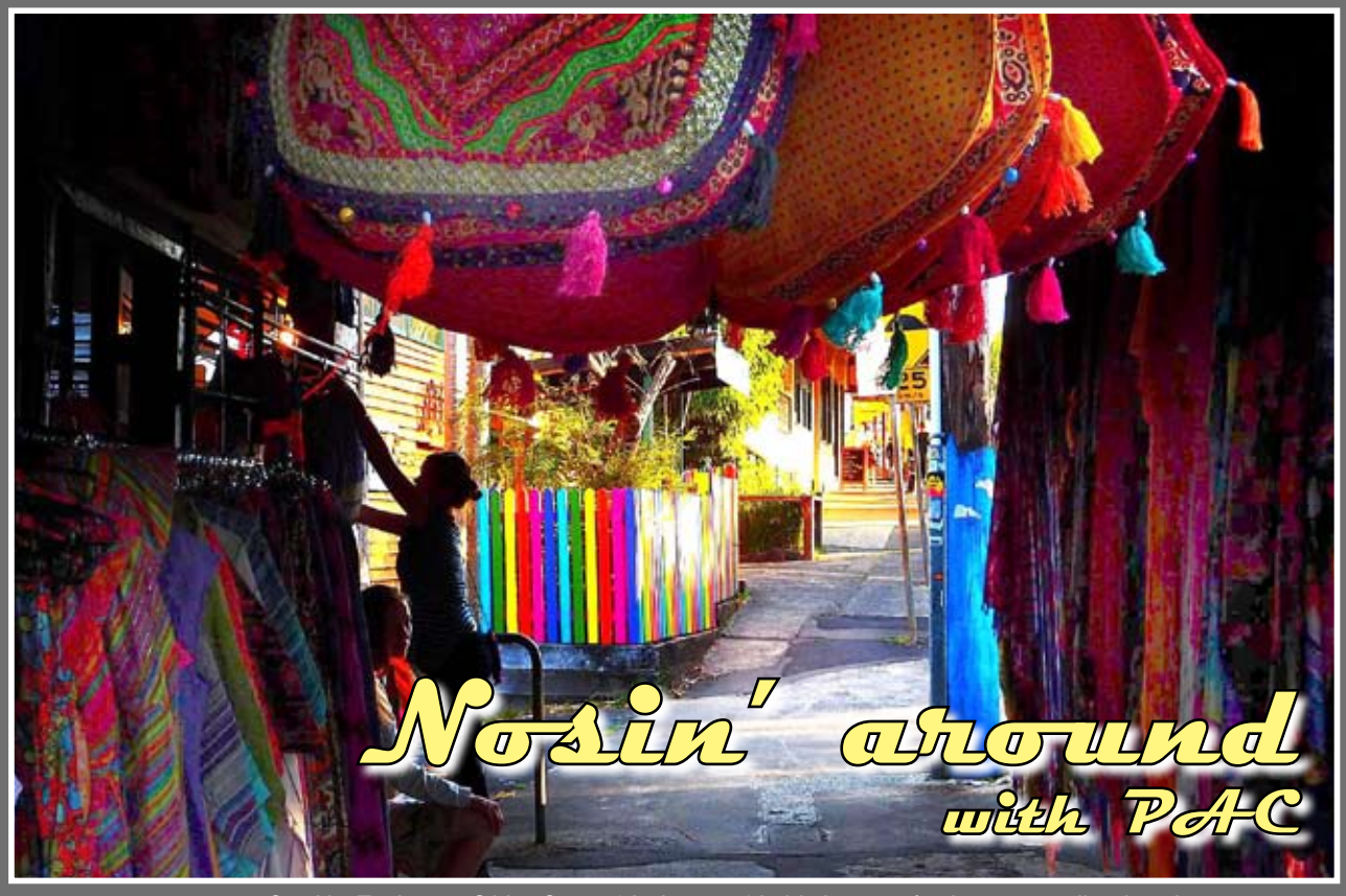
Susukka Trading on Sibley Street, Nimbin: an Aladdin's cave of colour, especially when the sun is setting

Check out: www.mullummusicfestival.com and come along to the biggest little festival in Australia and get down and party.