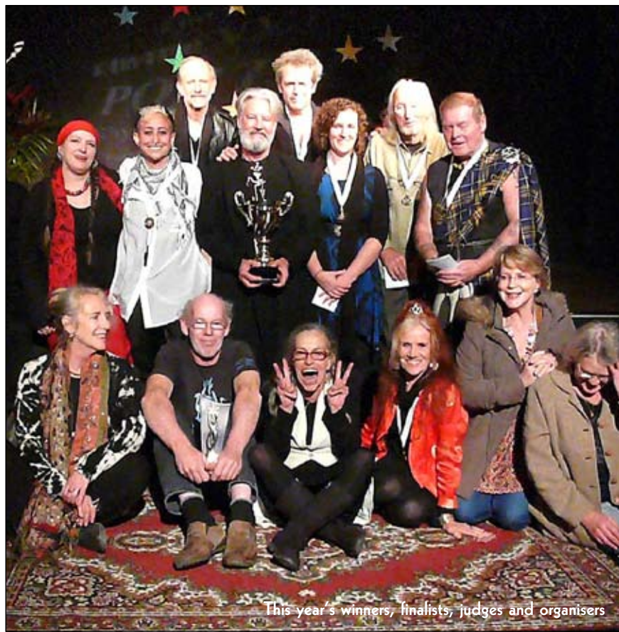
This year's winners, finalists, judges and organisers