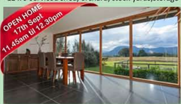
35/78 Cecil Road, Nimbin