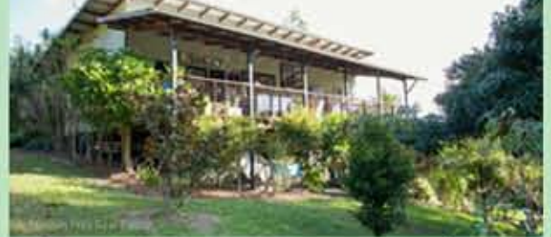
39/78 Cecil Street, Nimbin