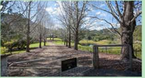
422 Blue Knob Road, Nimbin