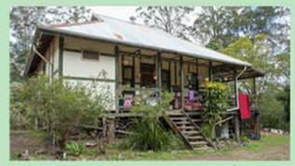
85 Lillian Rock Road, Nimbin