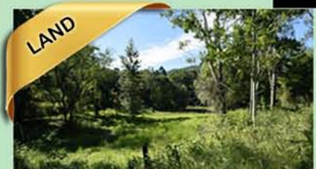
76 Anderson Road, Nimbin