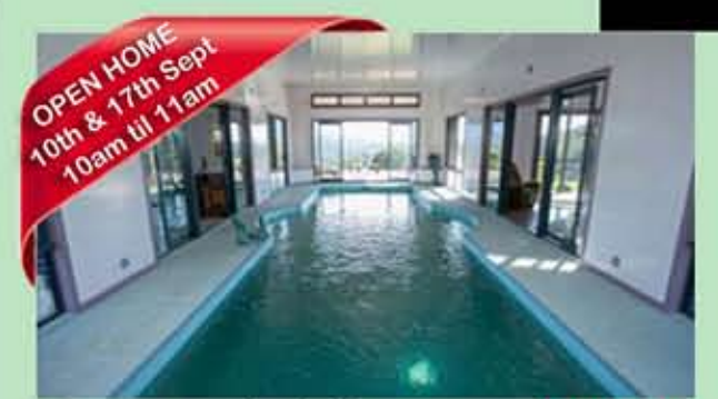
7 Stanger Road, Nimbin