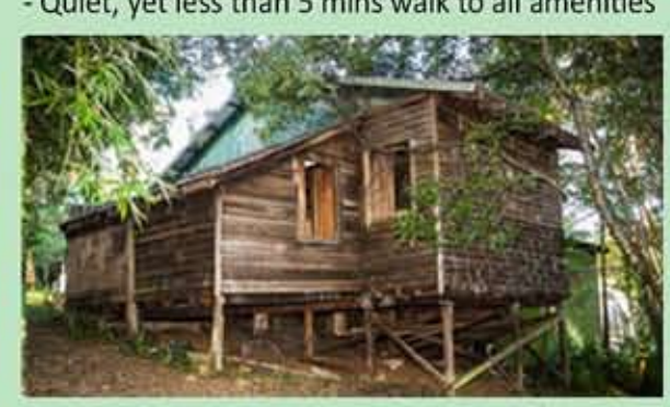
104 Gungas Road, Nimbin