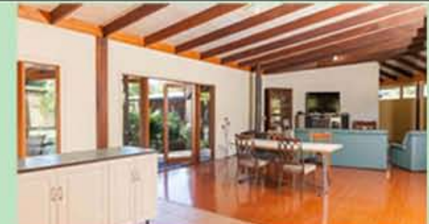
146 Oakey Creek Road, Georgica