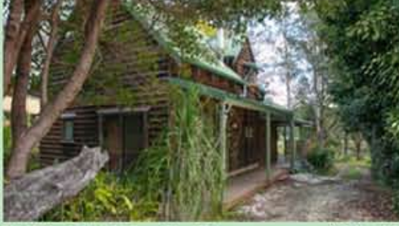
12 Silky Oak Drive, Nimbin