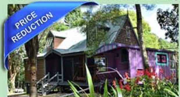
533 Blue Knob Road, Nimbin