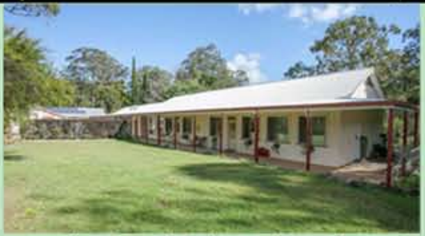
795 Williams Road, Barkers Vale