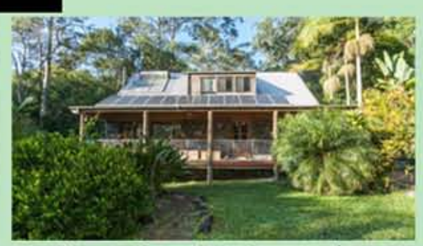
164 Lillian Rock Road, Nimbin