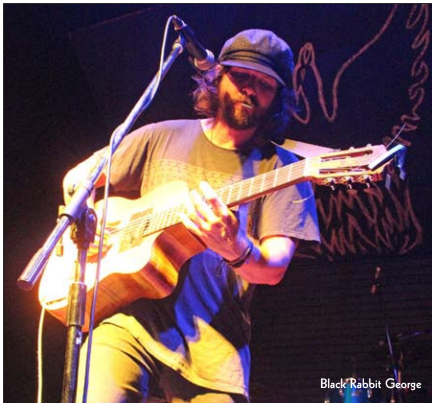
Black Rabbit George

As part of the festival there will also be the second Australian Roots Music Awards (ARMA), which will be showcased in a separate event on the last night of the festival. All the profits from the awards will be donated to the Nimbin Aboriginal Cultural Centre. Applications for the awards will be