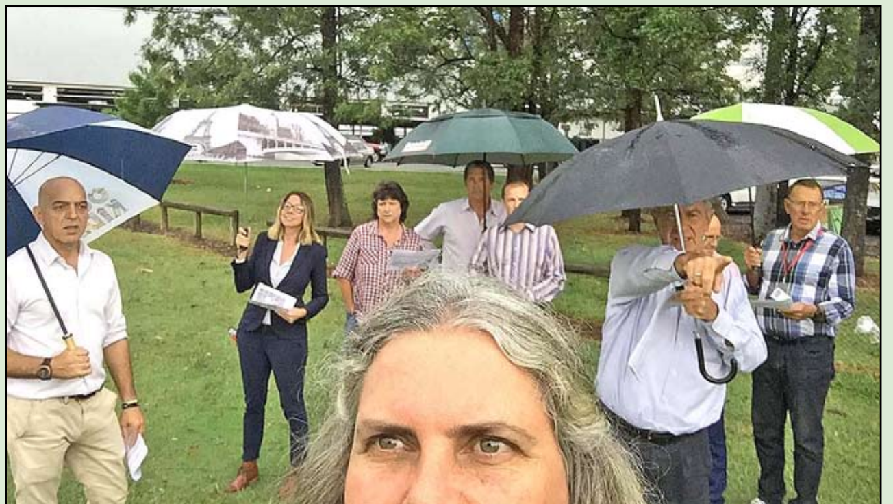
Site inspection with councillors in Lismore Park. The Masterplan includes creating a destination park by turning the concrete drain into a creek, creating a childrens water play area, amphitheatre for outdoor performance, promenade, picnic spaces, cyclepaths, cafe, toilets and open space to kick a ball around. Council plans to upgrade Oakes and Crozier Ovals as well. What do you think about turning some of our formal sporting fields into passive recreation spaces?