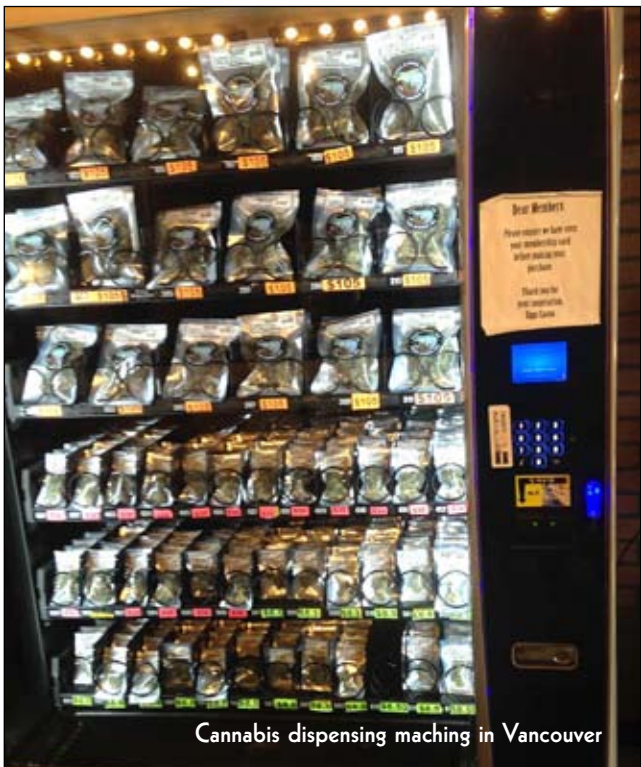
Cannabis dispensing machine in Vancouver