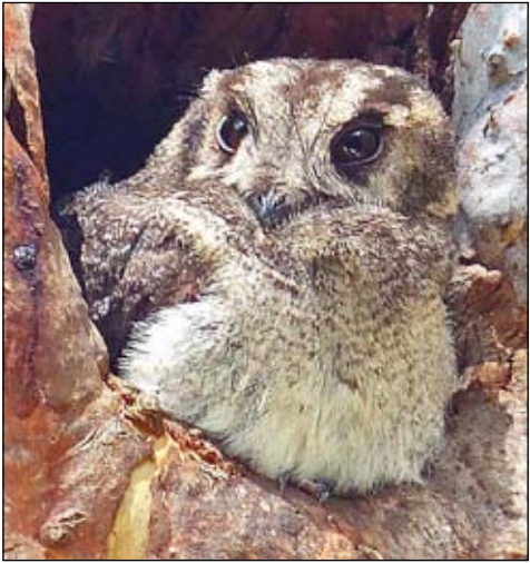
Owlet-nightjar at the Nimbin RocksCo-operative

Over the years, the Co-operative has also attracted grants for rainforest restoration. In 2011 it applied to the NSW Department of Environment, Climate Change and Water (now the NSW Office of Environment and Heritage) to have the western slopes and Sacred Sites area permanently protected as a Voluntary Conservation Area . In August 2014 this was finalised, with more than half the property (121.6 hectares) now protected.