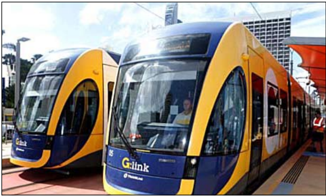
G-link trams at the Cypress Avenue station.