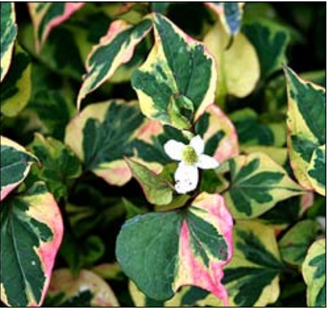
Fish plant ( Houttuynia cordata ) is a delightful, low growing, spreading ground cover loved by the Vietnamese and Chinese for it’s culinary and medicinal uses