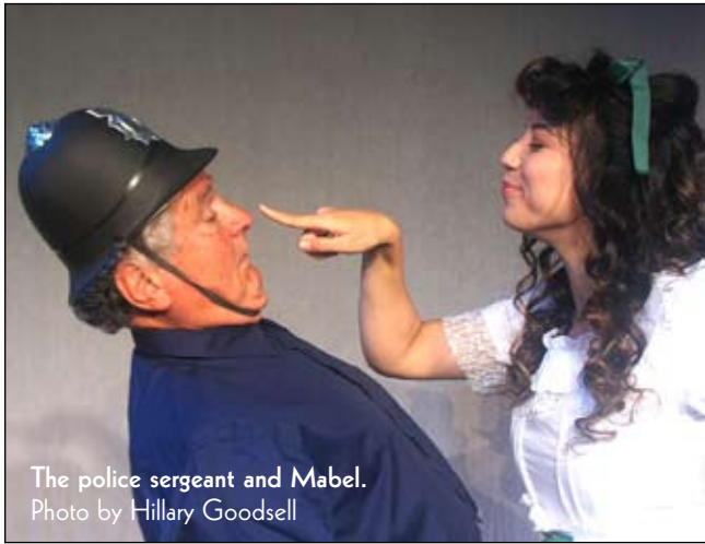
The police sergeant and Mabel.