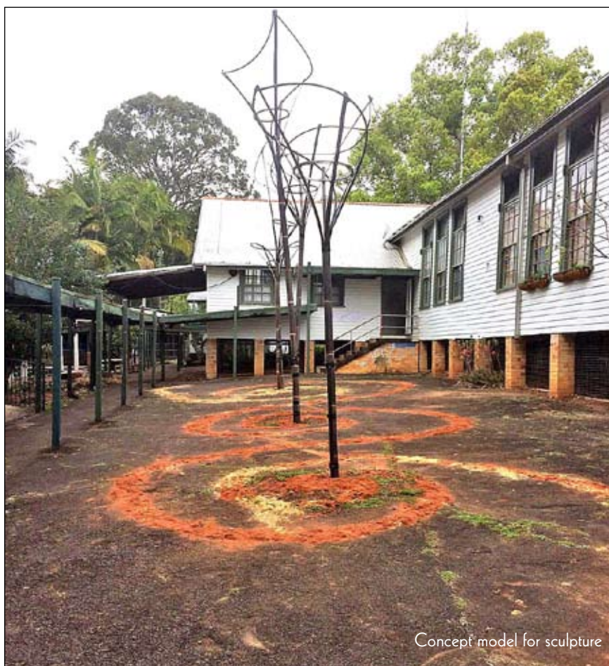
Concept model for sculpture

We will know by the beginning of May if we have been successful, so fingers crossed that we get the funding. If we don't, we do have a plan B and are also looking at other grants we could look at.