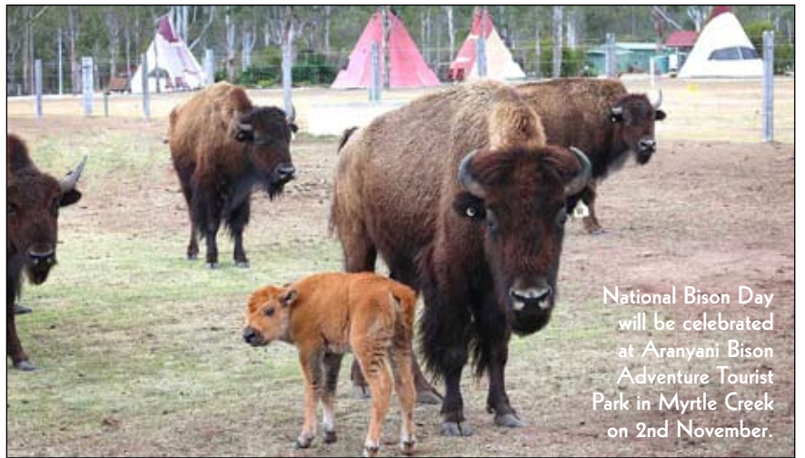
National Bison Day will be celebrated at Aranyani Bison Adventure Tourist Park in Myrtle Creek on 2nd November.

Calving season has started and we are having a naming competition for R's calf. The person whose name is selected as winner will receive a deluxe overnight Tipi stay at the ranch. There will be games with prizes and bison feeding demonstration with educational talk.