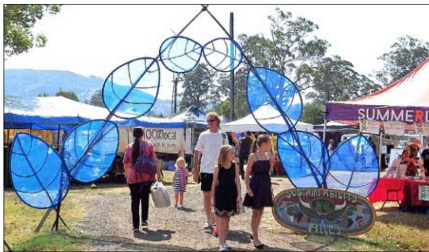
Be sure to visit Sustainability Alley at the Nimbin Show

The survey for Nimbin young people will be open until the end of September. We need to hear from our young peeps