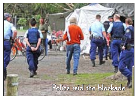
Police raid the blockade