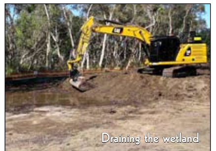
Draining the wetland