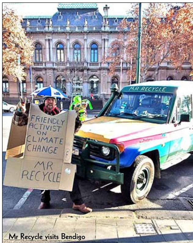
Mr Recycle visits Bendigo

This is the time of the year where forming new relationships and partnerships or strengthening existing ones is important for your personal journey toward achieving your goals. However, you will feel strongly about maintaining your independence versus being committed, and are less willing to compromise. Live your truth.