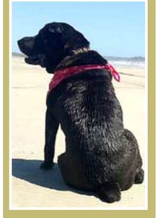
DOG OWNERS p.22