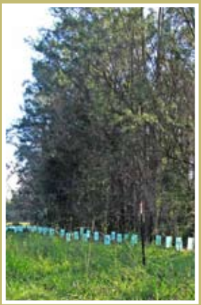
BUSH REGEN p.4-5