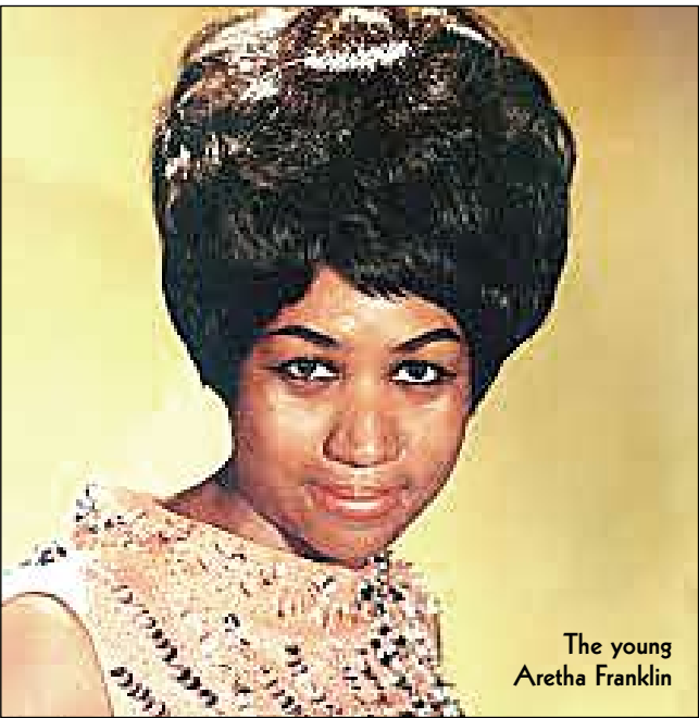
The young Aretha Franklin

You can get Disney+ free for the first month, which we did to see the Paul McCartney Interviews which were inspiring, and decided to keep going for the Genius series: Einstein , played excellently by Geoffrey Rush; Picasso , a great expose on the sleazy but brilliant painter; and Aretha Franklin , my favourite of the