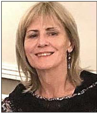
by Auralia Rose

When you speak, think of your words as light. When you see any negativity, touch your heart and let it radiate to that person or situation, it's powerful, transforming, it