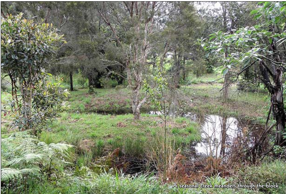
A seasonal creek meanders through the block

the Alternative Way subdivision and Nimbin Caravan Park. The vacant land, which will be purchased for $350,000 (plus acquisition costs) under title to Nimbin Community Centre Inc., encompasses a significant section of the Rainbow Road walking track. The purchase of the property facilitates a community vision to create a parkland – tentatively named Aquarius Park – which will serve as a retreat and experience for visitors and locals alike. Its acquisition will add depth to the walking track experience, providing opportunities for bird-watching, picnicking, education and socialising. The Chamber has agreed to contribute $20,000 to the purchase from funds collected by Lismore City Council for economic development in Nimbin. Rainbow Power Co. is contributing $165,000 plus a 50% share of acquisition costs, in return for a boundary adjustment that will deliver a bigger buffer between their operations and neighbours, while providing opportunities to explore subdivision into the future. Other community groups contributing are Nimbin Hemp Embassy ($30,000) and Jungle Patrol Street Cleaning ($30,000). The organisation carrying the weight of responsibility is Nimbin Community Centre. They have dug deep into reserves set aside for major repairs and are keen to recoup some of that investment through community donations. Following an appeal in last month’s GoodTimes , four donations have been made (thank you) but many more are needed.