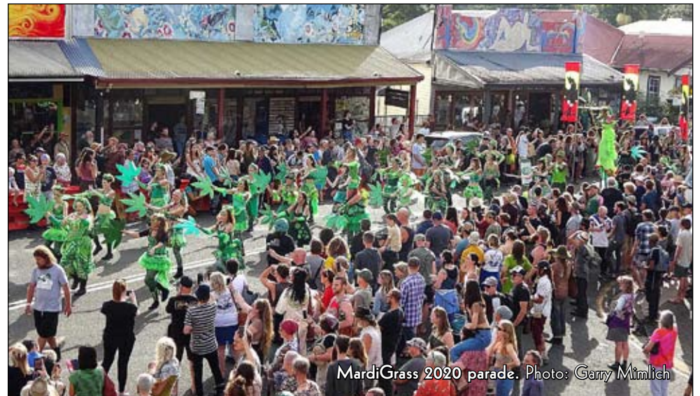
MardiGrass 2020 parade.

So there's plenty of passion for the 30th MardiGrass, and the MOB (MardiGrass Organising Body) meetings have started, Fridays from 4.20 in the HEMP Bar. We're looking for some special