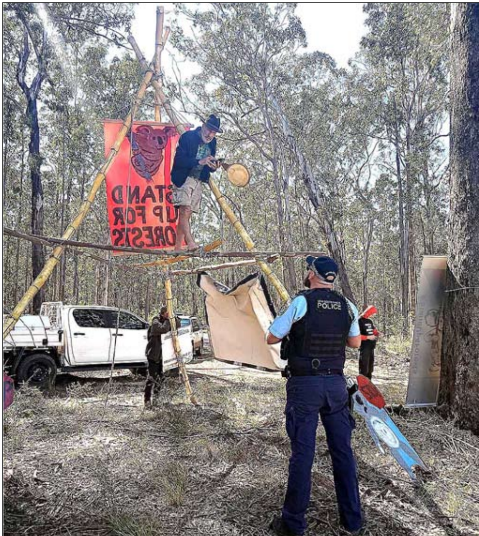
Tripodist Ian Gaillard protesting at Cherry Tree State Forest in November.