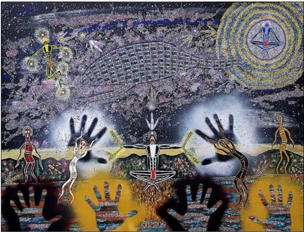
showcasing a major cultural event for both locals and visitors.

Seventy artists were involved in the School of Arts exhibition, together with all the artists engaged in the adjoining Nimbin Artists Gallery, and the exhibition was especially significant in