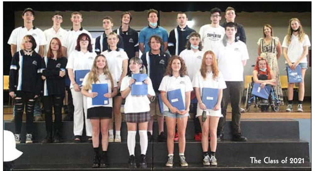
The Class of 2021

100% of the Extension 1 and 2 English classes achieved in the top two bands.