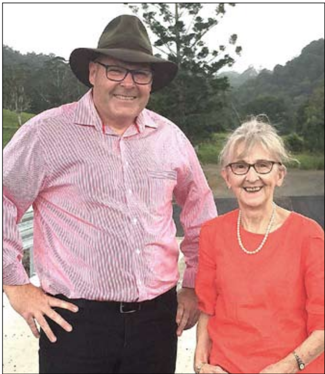
Lismore Mayor Cr Steve Krieg and Lismore MP Janelle Saffin

I lobbied the former Minister for Regional