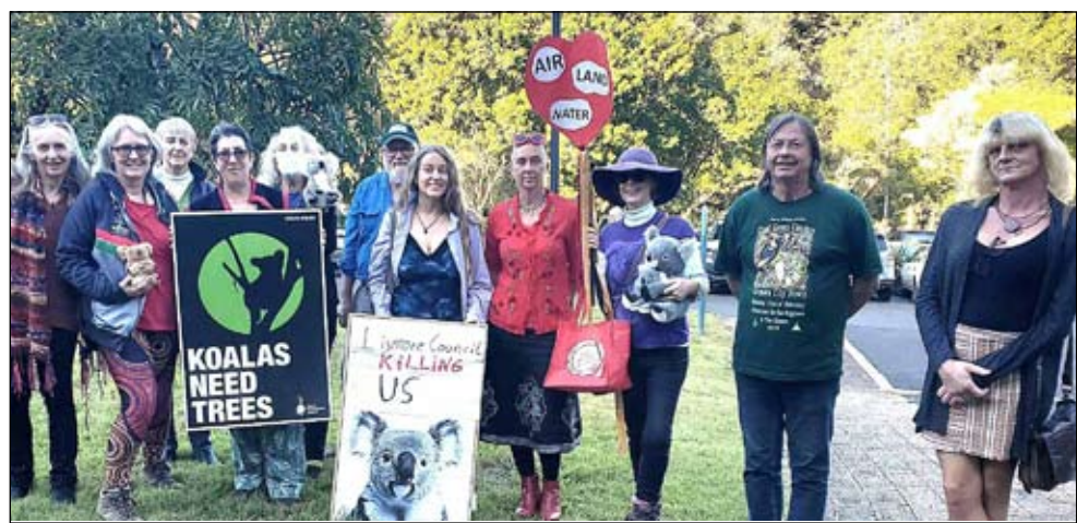
Koala protest at Limore Council’s June meeting.