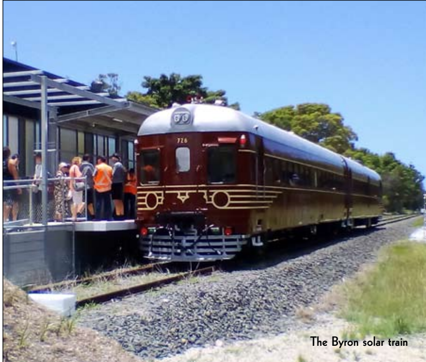
The Byron solar train

public transport needs for the population of the Northern Rivers and our huge numbers of visitors. The Rail Trail needs to be designed as an off-formation add-on to a regular train line. This exists in Bathurst, the electorate of deputy premier Paul Toole.