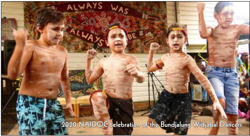
2020 NAIDOC celebration of the Bundjalung Widjagal Dancers

The day will begin with the Survival March at 10.30am from the Nimbin Hospital along Cullen St and into Allsopp Park. We hope that the town