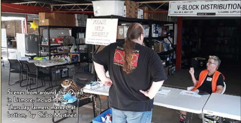
Scenes from around the Quad in Lismore, including the Thursday farmers market, at bottom