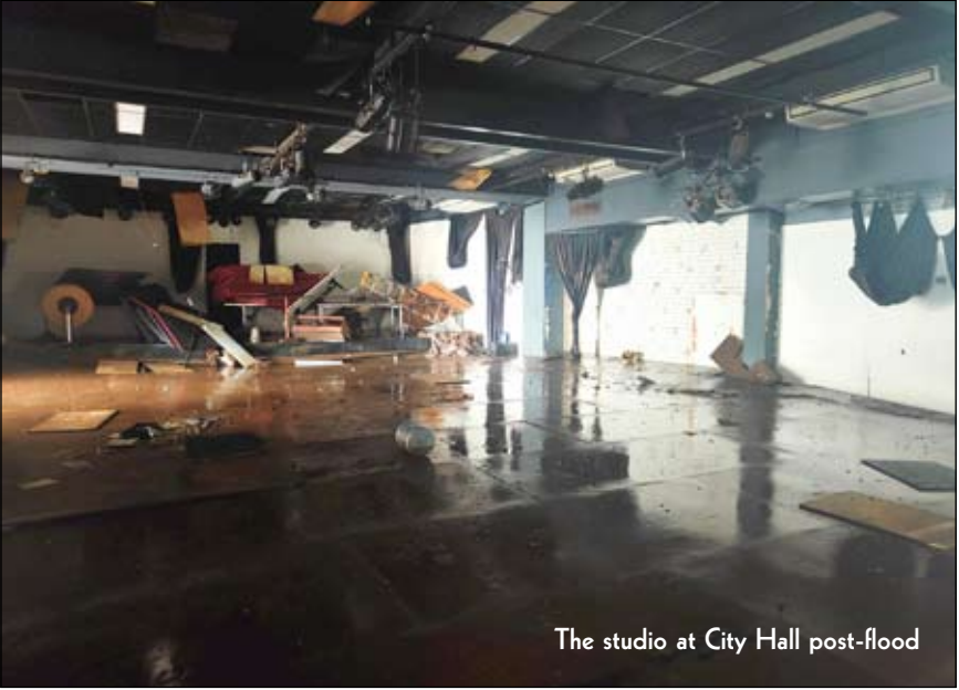
The studio at City Hall post-flood