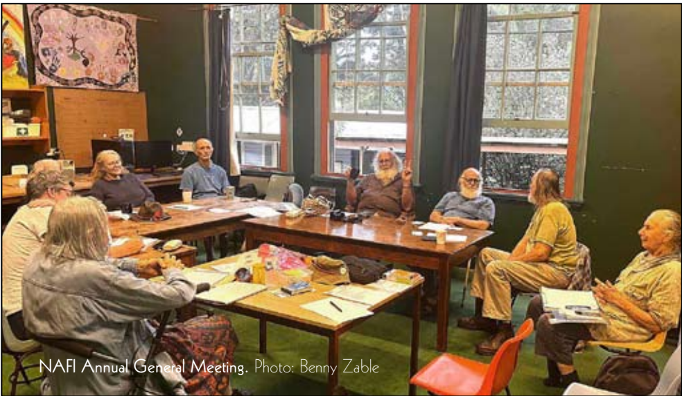
NAFI Annual General Meeting.