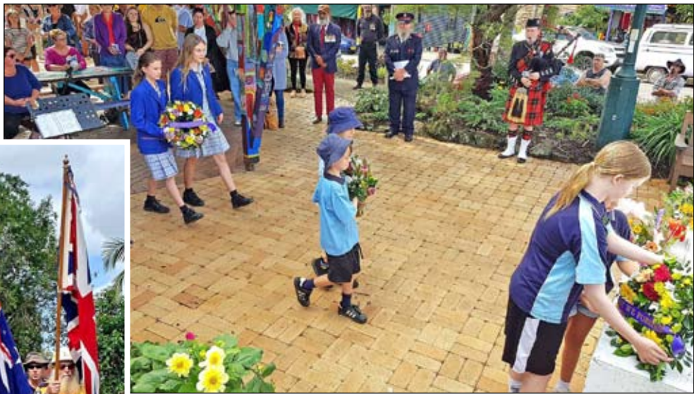
Preparations at Lismore's first war memorial