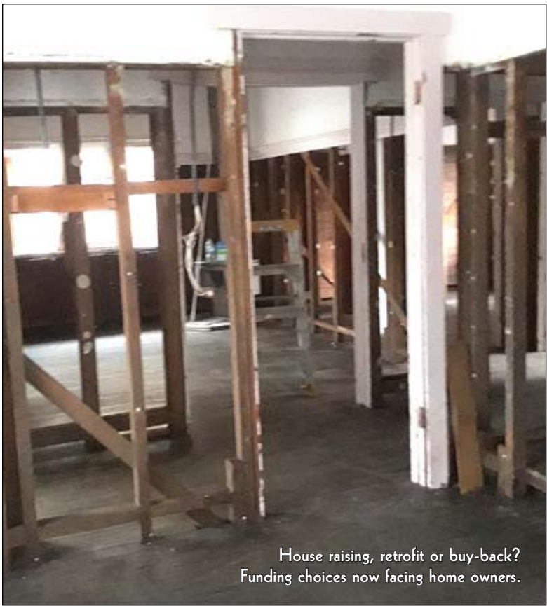
House raising, retrofit or buy-back? Funding choices now facing home owners.