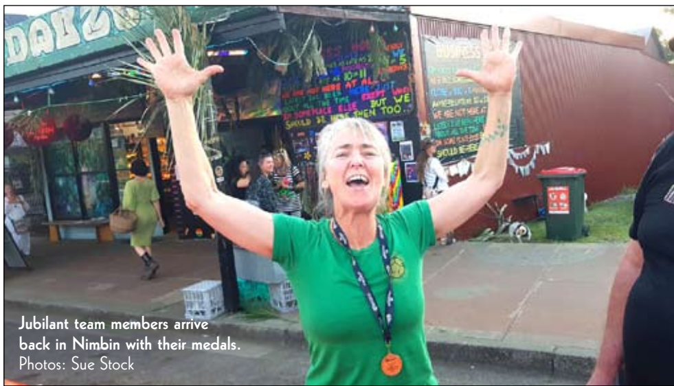
Jubilant team members arrive back in Nimbin with their medals.

I am so proud of you all and so pleased for you all. I love you all to bits – go the fabulous Fifths!