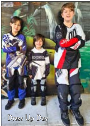
Dress Up Day

In the classroom we have also been having a lot of fun focusing on reading, writing, maths, art and STEM. Our junior class have been using the STEM design process to create a chair for the favourite toy. Our senior class have been using clay to create pencil holders and sketching in nature.