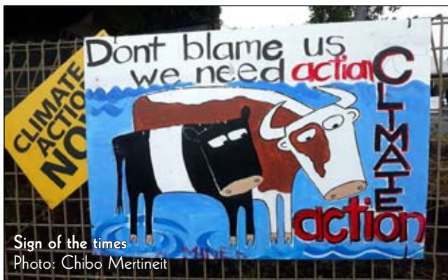
Sign of the times