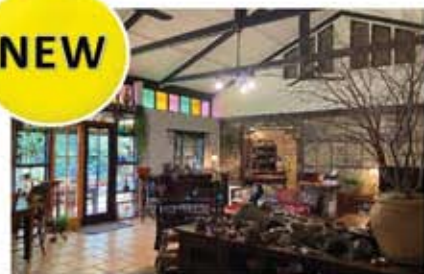
6/26 Mitchell Rd, Georgica 3.7 acres $600,000 - $650,000 Agent: Jacqui