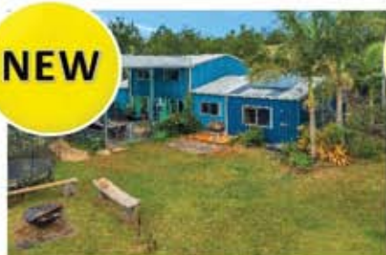
5180 Kyogle Rd Cawongla 15 acres $1,250,000 Agent: Jacqui