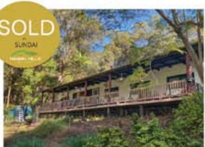
2/165B Cawongla Rd, Rock Valley 5 acres Contact agent Agent: Sundai