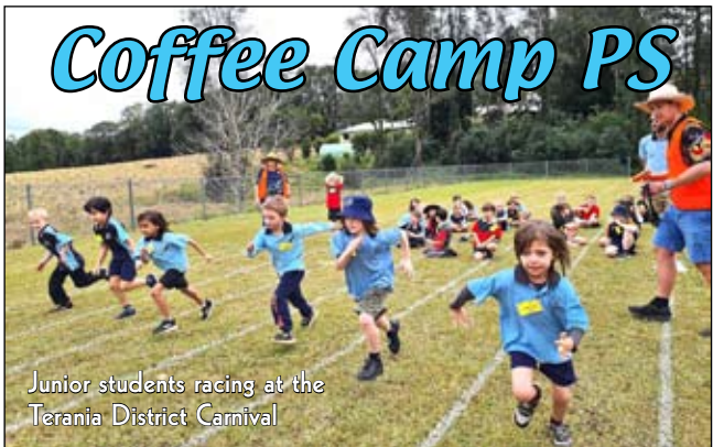
Junior students racing at the Terania District Carnival

This writing was produced at the Blue Knob Writers Group.