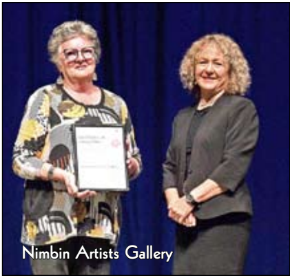
Nimbin Artists Gallery