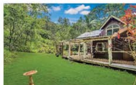
102/265 Martin Rd Larnook 2 acres $320,000 Agent: Jacqui