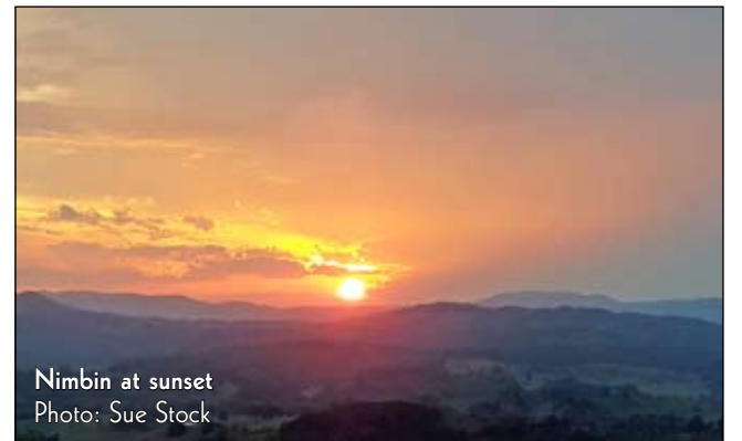
Nimbin at sunset