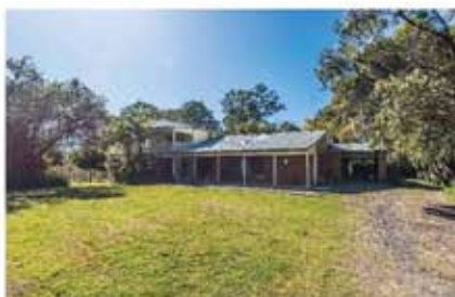
112 Homeleigh Road, Homeleigh 27 acres $1,300,000 Agent: Jacqui