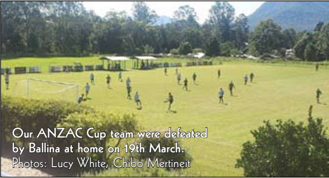
Our ANZAC Cup team were defeated by Ballina at home on 19th March.