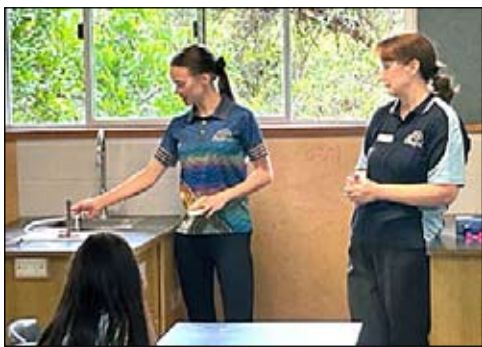
Year 6-7 Open Night at Nimbin Central School