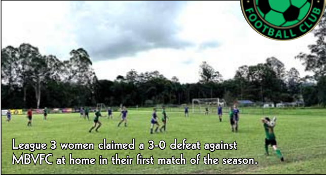
League 3 women claimed a 3-0 defeat against MBVFC at home in their first match of the season.