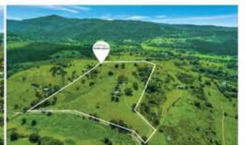
158 Crofton Rd, Nimbin Price - $1,275,000 m Agent Samara 2 1 4 40 Acres

ONE OF NIMBIN'S FINEST RURAL SELECTIONS! *early-settled homestead's position was chosen for its elevation over a fertile valley and its spectacular 180 degree views of some of the most dramatic peaks of the Nimbin Valley * 2 bedroom Edwardian home sits proudly, surrounded by pretty country gardens and looks out to the Nimbin Rocks, Blue Knob mountain, Lillian Rock, Sphinx Rock and Nightcap Ranges * 6 internal paddocks, a gravity-fed header tank and large house tank for water storage, 3 bay machinery shed plus a tractor shed and Bales with power. These functioning bales are perfect for the hobbyist or for hand milking cows or goats, and would be perfect for a secondary dwelling/guest house renovation. *The lifestyle buyer of this property will be smitten and perhaps will become a one-family holding for the next 50 years