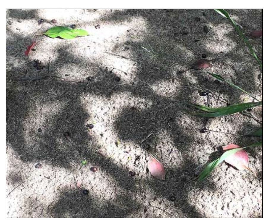
A fresh silt deposit smothers seedlings but now there's new soil for cvamphor seeds.

and topsoil deposited when the water dropped. The seeds were "released" from competing vegetation, hard compacted soil and scant nutrients.