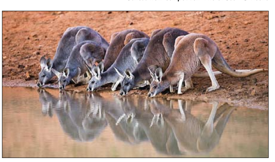
Abundant water (bore drains) and removing predators in the outback caused a population explosion in Red Kangaroos, an example of ecological release.