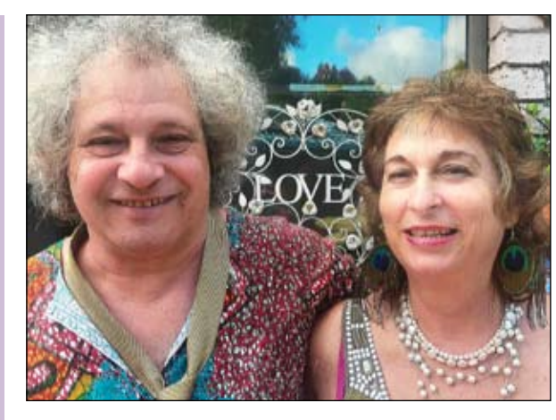
by Uncle Norm & Aunty Maj

Add lemon or lime juice and mint leaves to shoosh it up. Plant a lemon myrtle and make refreshing iced teas in summer when you need more of the liquid stuff than ever.