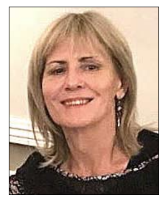
by Auralia Rose

They will quickly learn that expressing anger results in