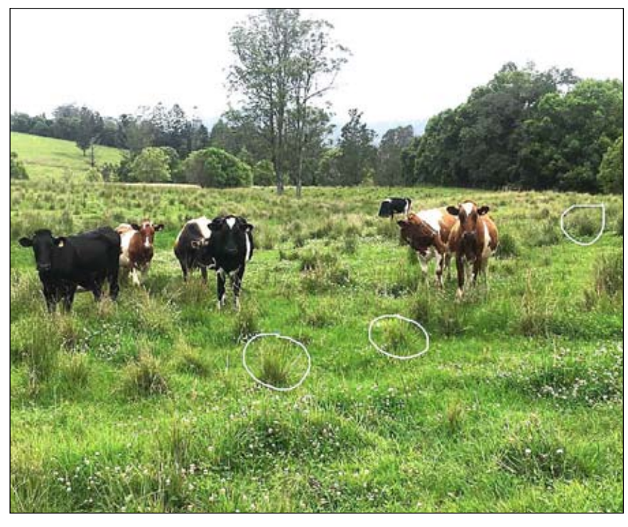
Cattle don't eat Juncus (circled). When they graze heavily on grasses, they release the Juncus from competition.

Devils Fig seeds were in the mix of silt