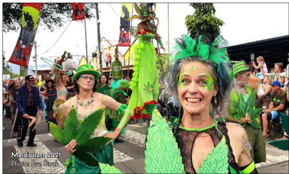
MardiGrass 2021