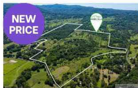
NEW PRICE 20 Gungas Road Nimbin Land 178 Acres $1,100,000 Agents: Samara & John