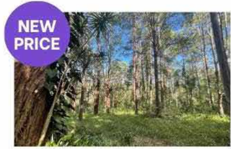
NEW PRICE 345 Blue Knob Road, Blue Knob Land 20 Acres $350,000 Agents: John & Jacqui