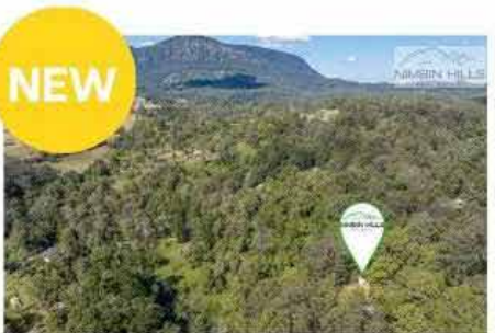
NEW 11/52 Cadell Road Mount Burrell 3 Acres $325,000 Agent: Jacqui