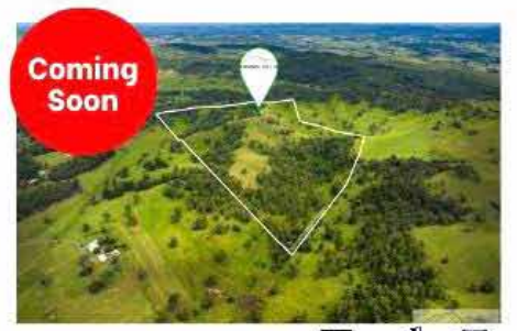
Coming Soon 372 Ettrick Road Ettrick 101 Acres 2 1 6 $1,280,000 - $1,320,000 Jacqui & Suzy