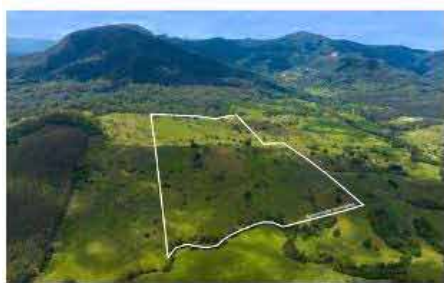
19 Moffit Road Nimbin Land 165 Acres $1,750,000 Agents: John & Samara