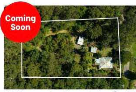
Coming Soon 176 Gungas Road Nimbin 6070m 2 3 2 6 $800,000 Agents: John & Michelle