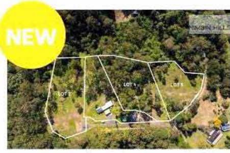
NEW Lots 2, 4 & 5/7 High Street, Nimbin Land, Land Land! $462,000 - $480,000 Agent: Jacqui