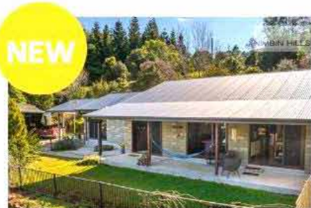
NEW 182 Bentley Road Tullera 25 Acres 3 1 4 $1,200,000 Samara & John