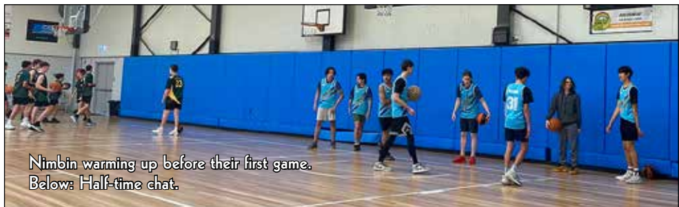
Nimbin warming up before their first game. Below: Half-time chat.

Nimbin Boomers continued their winning streak against